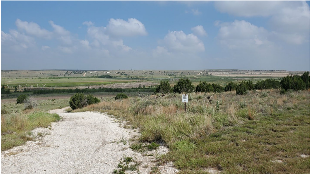
View of Palo Duro Reservoir from the South Low Water Ramp. Taken August 18, 2022.

Second View of Palo Duro reservoir, taken August 18, 2022. The reservoir spillway can be seen in the lower left corner of the image.