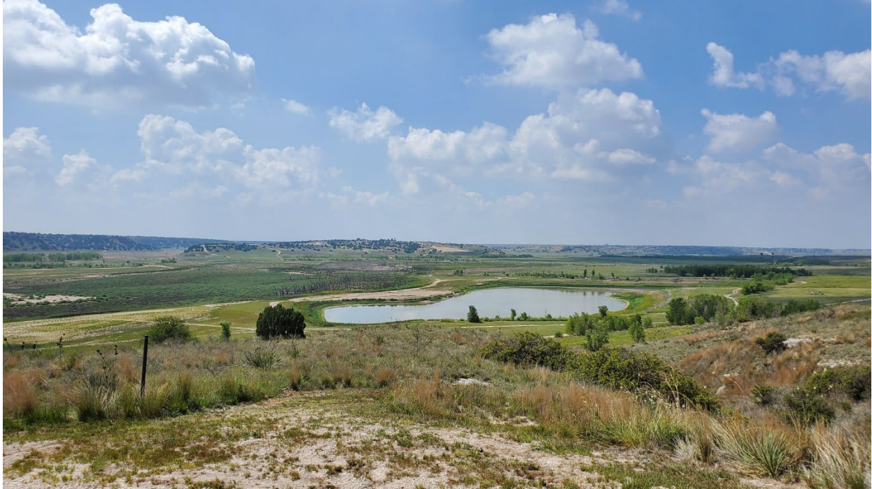
View of remaining water at Palo Duro Reservoir. Taken from top of dam August 18, 2022.