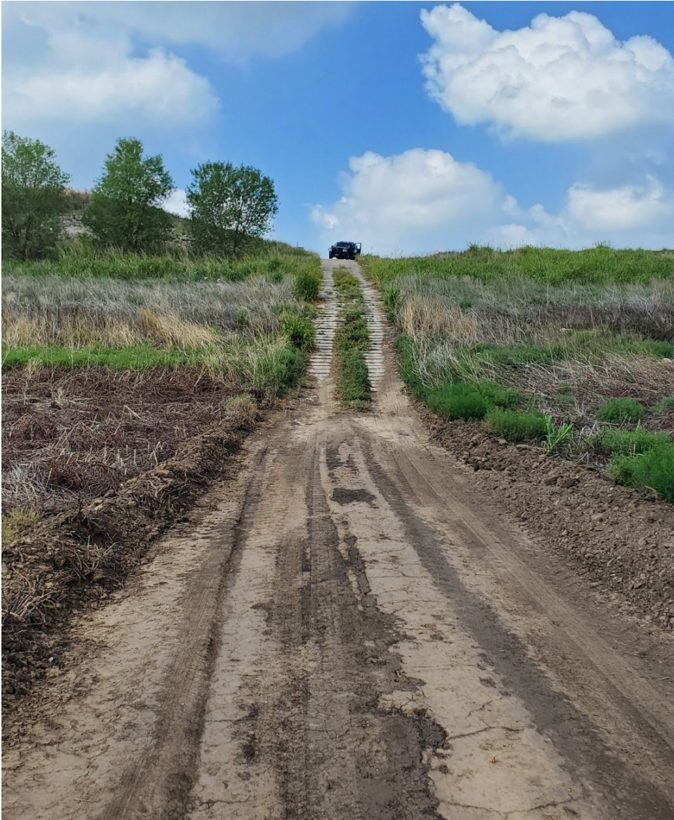
View looking up at the South Low Water Ramp at Palo Duro Reservoir. Taken August 18, 2022.