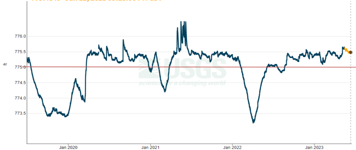
Figure 1. Daily water level elevations in feet above mean sea level (MSL) recorded for Comanche Creek Reservoir, Texas, July 1, 2019, through June 12, 2023. The figure is from the United States Geological Survey (USGS) website. NGVD 1929 refers to the National Geodetic Vertical Datum of 1929. The horizontal line indicates Conservation pool (775).

775.48 ft - Jun 12, 2023 09:15:00 PM CDT