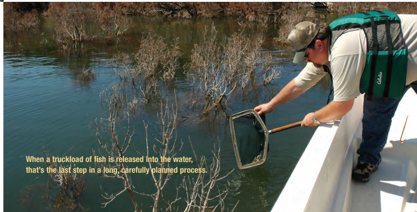
When a truckload of fish is released into the water, that's the last step in a long, carefully planned process.

These hatcheries are open to the public and available for tours. For details: www.tpwd.state.tx.us/fishboat/fish/management/hatcheries/