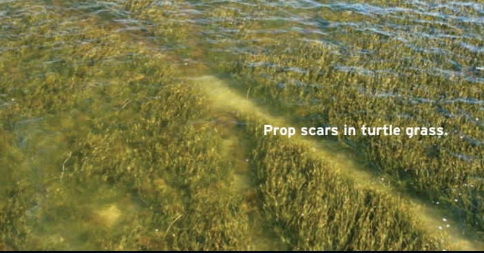
Prop scars in turtle grass.