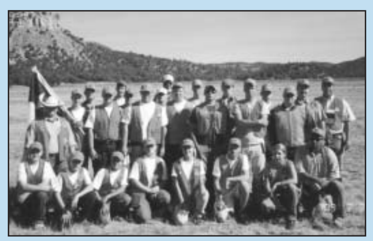
Pictured here is part of the group from Texas who participated in the event. THEIA provided registration fees for the top winners from state competition held in May.

Hundreds of hunter education graduates from across North America, and their families and coaches, met this summer at the NRA Whittington Center near Raton, New Mexico to participate in the 2003 International Youth Hunter Education Challenge (YHEC) on July 28-August 1. Nationwide declines in hunting accident rates bear out the value of hunter education. YHEC is an advanced hunter education program designed to enhance classroom knowledge and increase practical, in-the-field experience. The result is a generation of better trained, more responsible and more skillful young hunters. Participants in the annual international event compete in eight events that test hunting knowledge and skill: .22 rifle, shotgun, archery, muzzleloading, orienteering, wildlife identification, hunter safety trail and a written hunter responsibility exam. Nearly 43,000 youths take part in state and Canadian provincial-level YHEC each year, and each are welcome at the annual international event.