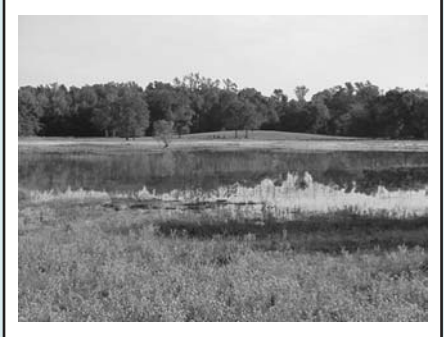
Before and after photos of a constructed wetland in Panola County.

the amount of land owned between the landowners exceeding 74,000 acres. Seventeen wetland proposals were developed between project biologists, Ducks Unlimited and Natural Resources Conservation Service personnel; 13 of which were approved for habitat improvement on 527 wetland-acres. There is very high interest in wetland development of private lands in East Texas, with over 25 additional sites, in excess of 1,500 acres, waiting for survey and wetland habitat design.