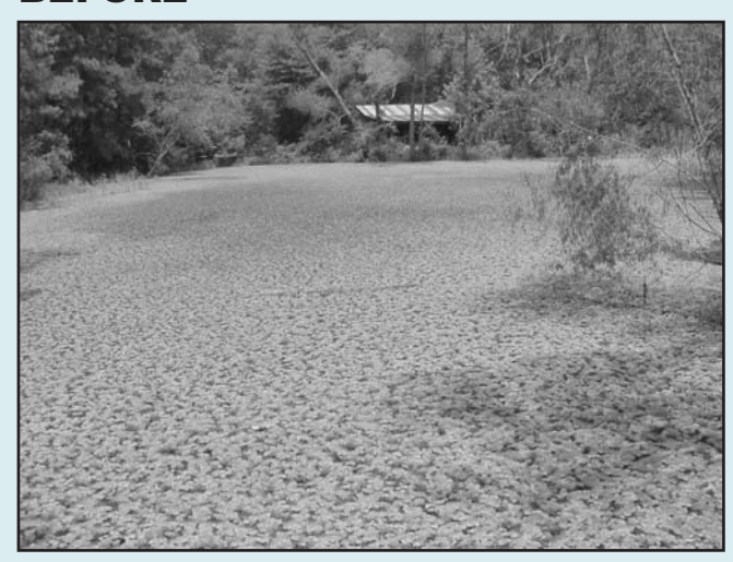
This 0.75-acre pond at Splendora, Texas, just north of Houston, was heavily infested with giant salvinia when this picture was taken on 6/28/01. The pond was treated with aquatic herbicide Sonar®A.S. on the same day.