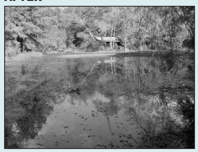
This picture of the same pond was taken on 9/7/01, or about 73 days after treatment with Sonar<sup>®</sup>A.S. Reports state that the pond is now 100% free of giant salvinia.

Diquat dibromide (Reward®) at .75% v/v or 3 quarts per acre has been employed since spraying began on Toledo Bend in May 1999. The adjuvants used in combination are: a non-ionic penetrant (either Aqua-King Plus® or Activate III®) at .25% v/v or 1 quart per acre and a non-ionic organo-silicone Thoroughbred at 12 ounces per acre. Initially, only 6 ounces of the organo-silicone were used, but field tests indicated a higher herbicide efficacy with the 12 ounces. Some applicators are now even using a full pint of the organo-silicone. The hairs or pubescence on the leaf surface of giant salvinia actually repels moisture so that the organo-silicone is a valuable and necessary component of the spray mix.